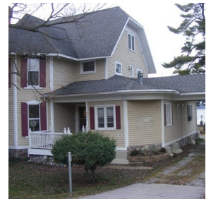
Photo: Leonard S. Hoxsie's house, built on the East Bay shore in Acme in 1875

October: For a Halloween treat, Tim Carroll led a tour through Oakwood Cemetery, pointing out the headstones of both the famous & infamous of Traverse City and Peninsula Township.